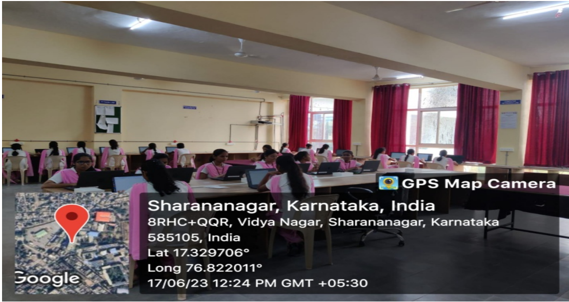
LABORATORY 1- ADA/ DSC Lab