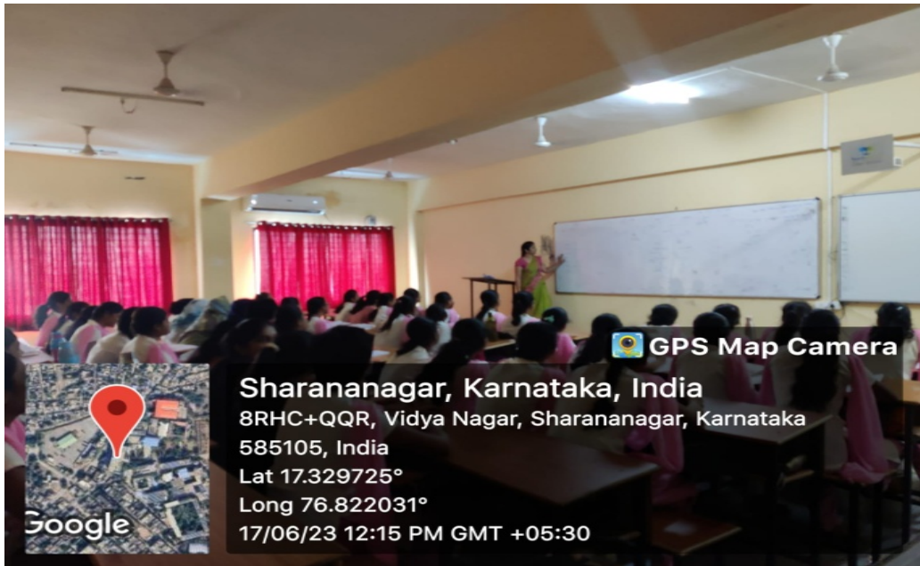
CLASS ROOM 1