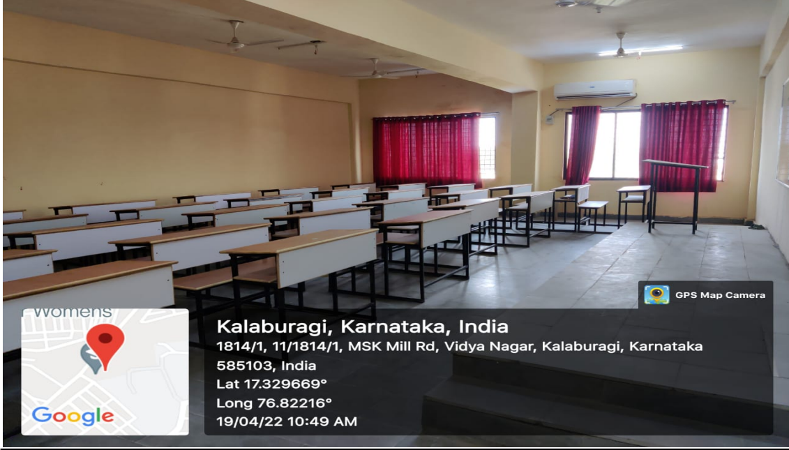
CLASS ROOM 2